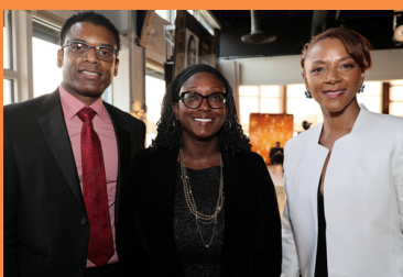
2023 Gala Awardees

Oliver Scholars Alumni were recognized at the 2023 annual Gala for their outstanding achievements in Scholarship, Leadership, and Service, core pillars of the organization, and for their dedication to giving back.